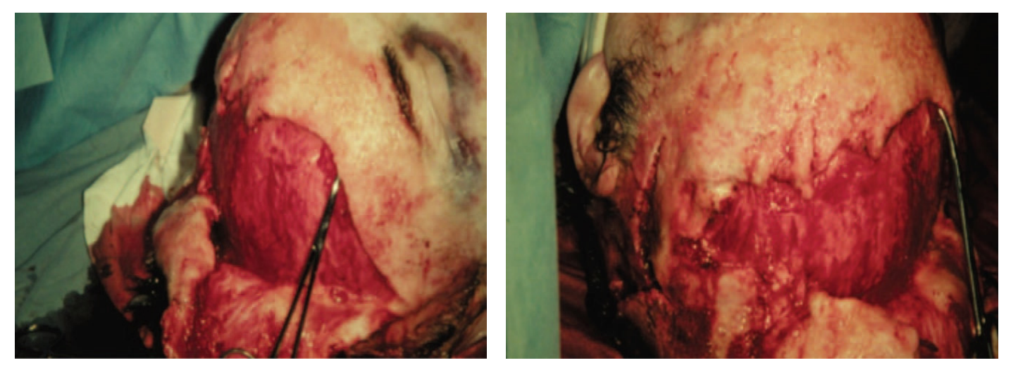
These photos demonstrate the blood loss that can come from a scalp laceration.

It is much easier to visualize the laceration if there isn't bloodied, matted hair over and inside the wound. It is the author's opinion, running a razor or shears over the area either before or after stopping the bleeding makes closure and wound care easier. The author is not advocating stopping emergent treatment for a complete head shave, but is simply stating that if you cannot see a portion of the wound due to dirt or matted hair, it is very difficult to treat it. This area can be easily addressed with the razor or the shears and then attention can be directed back to haemostasis.Prior to obtaining primary closure, the scalp wound should be copiously irrigated with normal saline (NS). Using a 16 or 18 gauge angiocath and puncturing the lid of a one liter plastic bottle multiple times will give the user a nice water source that can be placed under pressure to sufficiently wash out the wound. This can be repeated as necessary until gross debris (hair, dirt, etc) has been removed. At this point, the author uses a chlorhexidine scrub brush or swab (or betadine/iodine) and goes over the wound an additional time, then follows with another rinse of NS.